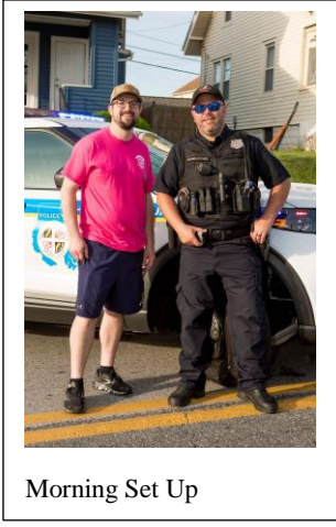
Morning Set Up