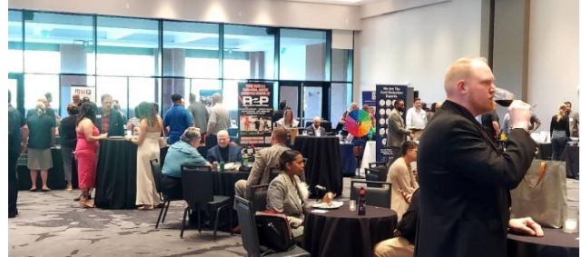
Members enjoy networking and noshing.