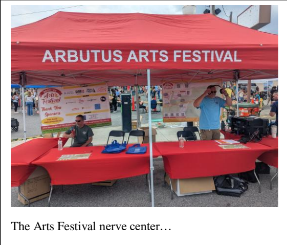
The Arts Festival nerve center...